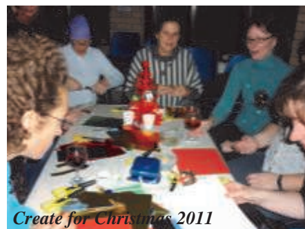
Create for Christmas 2011

The Reading Group chooses a different book each term. Membership is flexible – you can come and go depending on whether the chosen book interests you. Contact the church office for more information, on 441007 or office@allsaintsmilton.org.uk